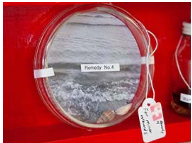
Social Pharmacy: New Jersey, Installation View, Skövde Art Museum, Sweden, 2022