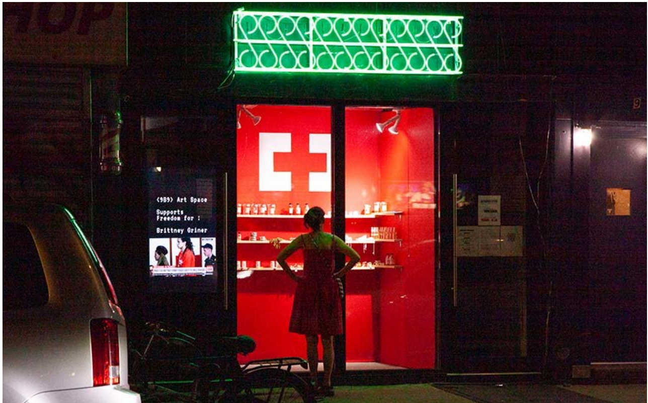
Social Pharmacy , Installation view at Whitebox Gallery, NYC, 2022