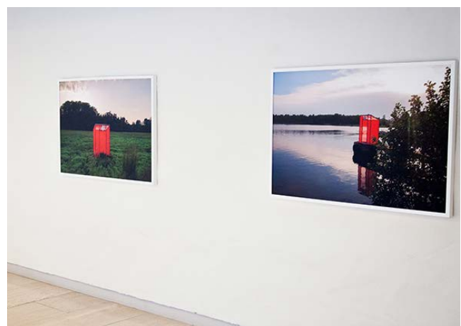
Social Pharmacy: Portraits , Installation View, Norrtälje Konsthall, Sweden, 2022