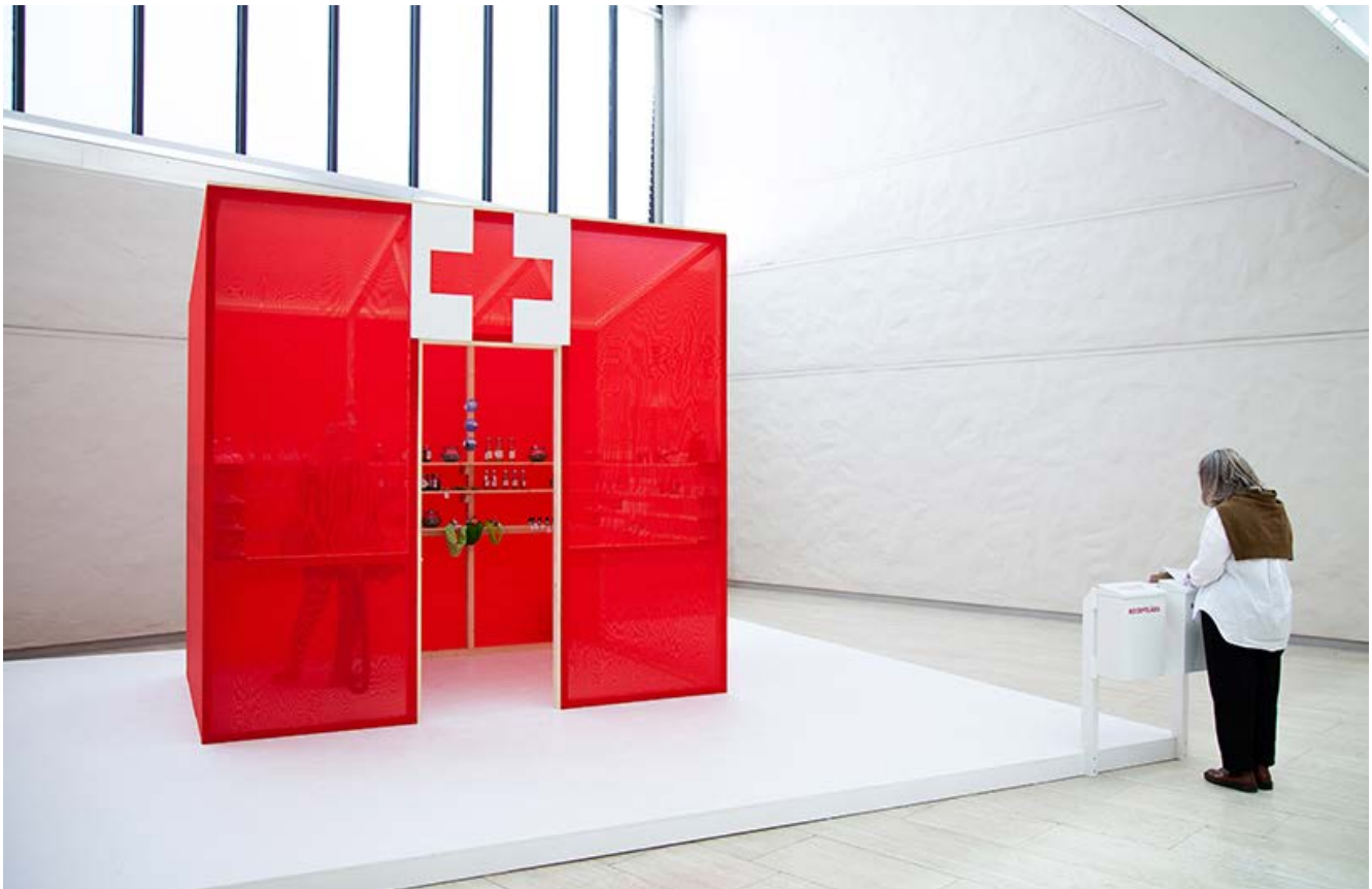
Social Pharmacy , Installation View, Skövde Art Museum, Sweden, 2022

Social Pharmacy (Folkets Apotek) is a site-specific exchange of health remedies. The work presents individual health as a collaborative performance scripted and enacted by strangers living in proximity of one another, moving an individualistic behavior of self-care into a relational gesture of community care. Participants are co-authors; they are invited to share their own recipe for a health regiment, and in exchange, take away a community member's remedy for emotional, mental, or physical health. The project becomes a dynamic living library of people who comprise a specific locale, in the present and in generations past.