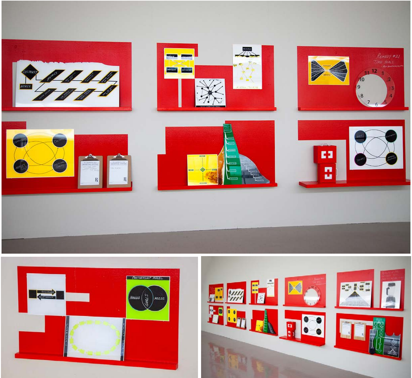
Taxonomies of Care, Installation View, Skövde Art Museum, Sweden, 2022

This series of data portraits depicts power flows and organizational dynamics of hospital systems