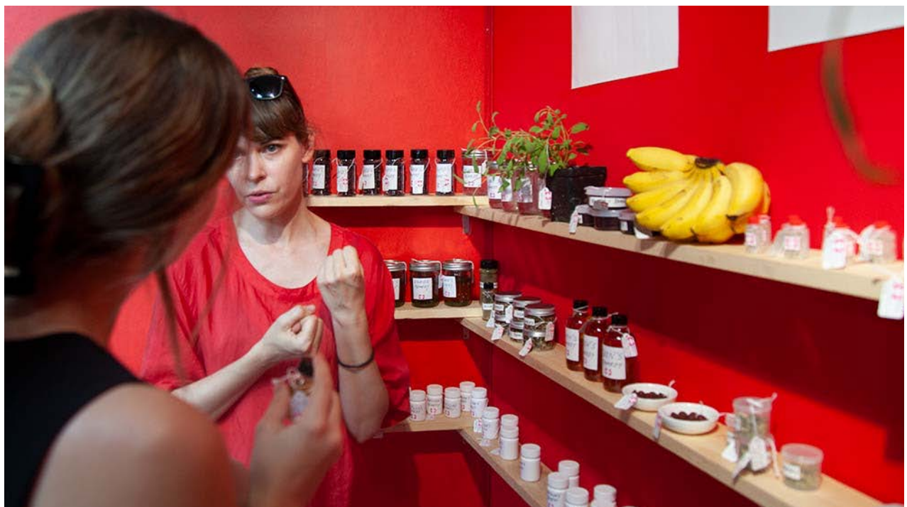
Visitors browse inside window installation of Social Pharmacy at Whitebox Gallery, NYC, 2022