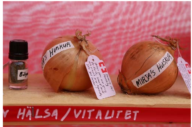
Social Pharmacy , Installation view in Simpnäs, Sweden, 2021, Supported by Skövde Art Museum and AiR BKN.