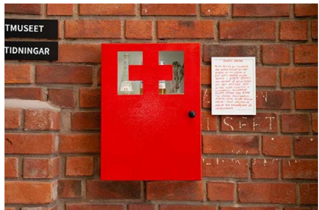
First Aid Kit, Installation View, Skövde Culture Center, Sweden, 2022