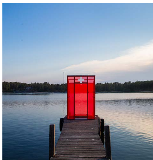
Artist monograph (left), Social Pharmacy: Portrait Series , Inkjet Print, 2021