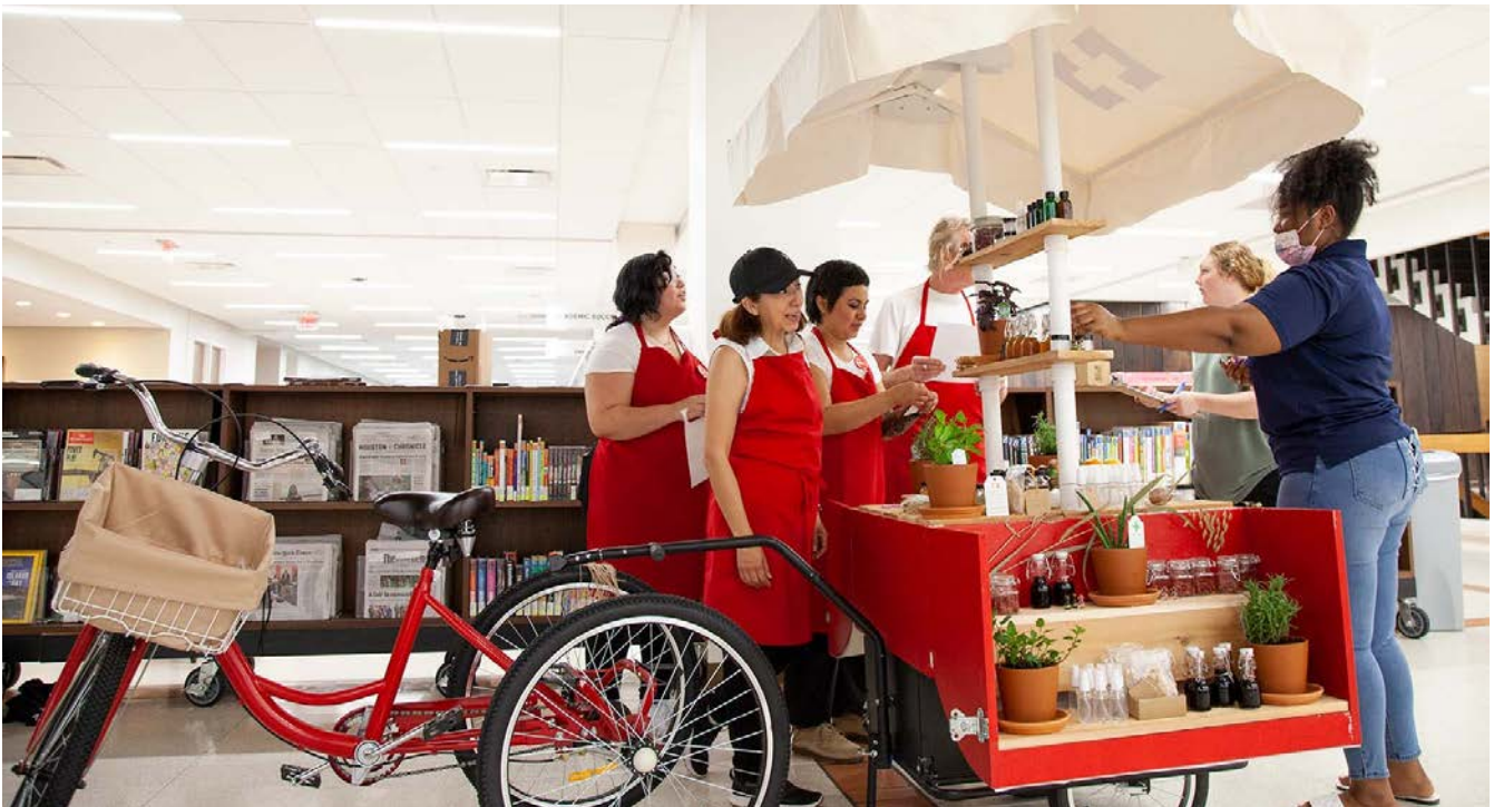
Traveling Social Pharmacy led by MFA students in collaboration with Jody Wood in Huntsville, TX