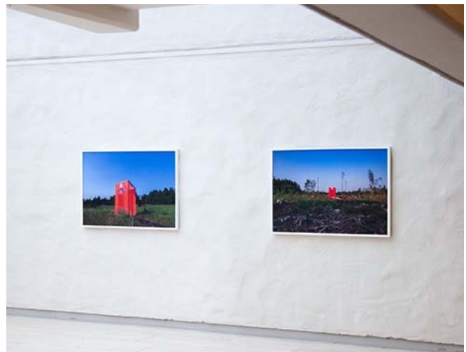
Social Pharmacy: Portraits , Installation View, Skövde Art Museum, Sweden, 2022