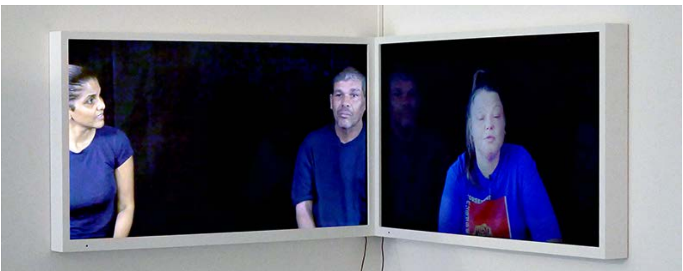
Against Medical Advice , Installation View, Norrtälje Konsthall, 2022