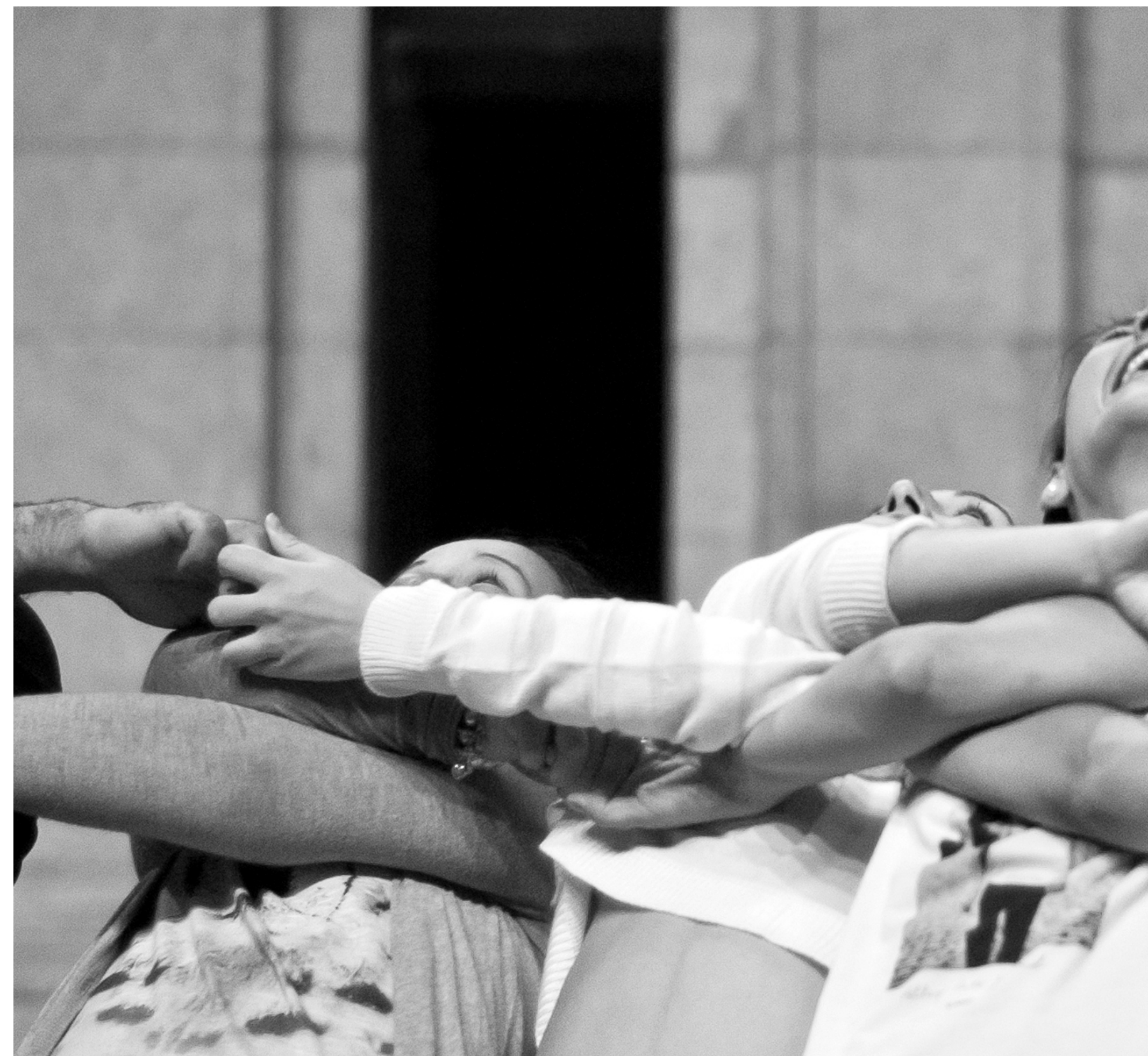
[PELE – PATRICIAPOÇÃO]